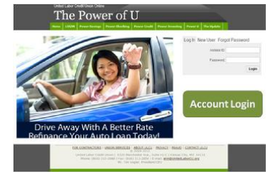
Secure Internet Access

Introducing ULCU's Automated Phone Teller System! Call VTeller at (866) 631-0244, anytime for account information!